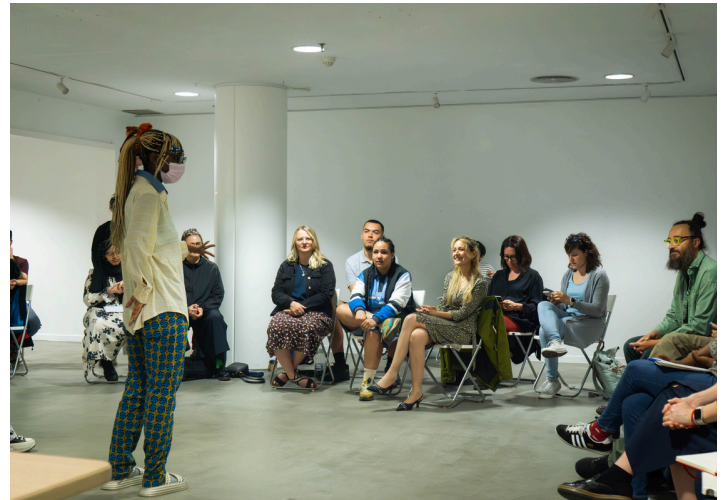
Young people and Platoniq team taking part of Mindset Revolution Barcelona Dialogue workshop

We are also not creating safe environments for our young people. In Spain, among those who have shared their psychological problems with their environment, the most common thing is to turn to friends (28.3%) or family (17.2%), to a lesser extent to other people (8.8%) and practically residual to teachers (0.6%). A phenomenon that also affects health professionals. The fact that almost 4 out of every 10 young people in Spain (36.4%) acknowledge having felt loneliness at some time and that the proportion of young people who have experienced it with some or very frequency amounts to 45.3% may be a reflection of this lack of safe spaces.