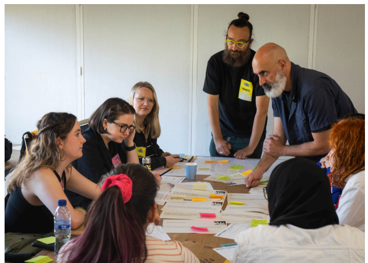
Young people and Platoniq team taking part of Mindset Revolution workshop

For example, evidence that children and young people are more likely to have poor mental health if they experience living in poverty; parental separation, financial crisis or parents with poor mental health. In Spain, people with the means to meet their material needs who suffer from mental health disorders represent 53%, while people that live in precarious conditions represent 68%. When talking about gender, among young people, men with mental disorders represent 52%, while women represent 67%. In the UK, women are three times more likely than men to experience common mental health problems. Also, young people who identify as LGBTQ+ are also more likely to suffer from a mental health condition, which are exacerbated by inequalities in accessing appropriate support.