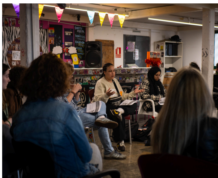
Young people and Platoniq team taking part of Mindset Revolution Barcelona Dialogue workshop

Legislative Theatre plays are not stories of helpless people. Participatory work is about agency. The characters of an LT play work to challenge the oppressions they face and seek allies. During the LT performance, an audience of community members and policymakers plays the crucial role of spect-actors.